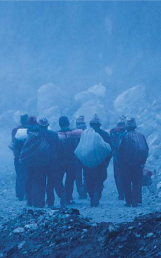
Mi Chacra/My Land