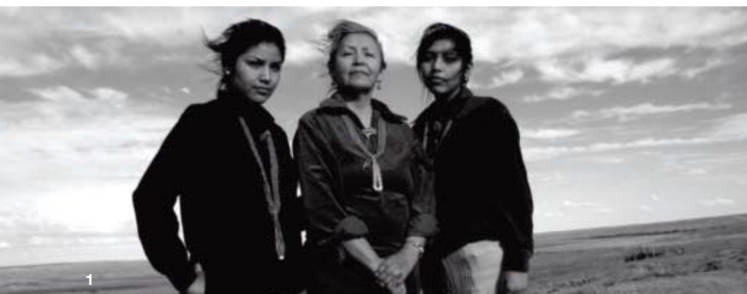
1 Shimásání 2 Kissed by Lightning