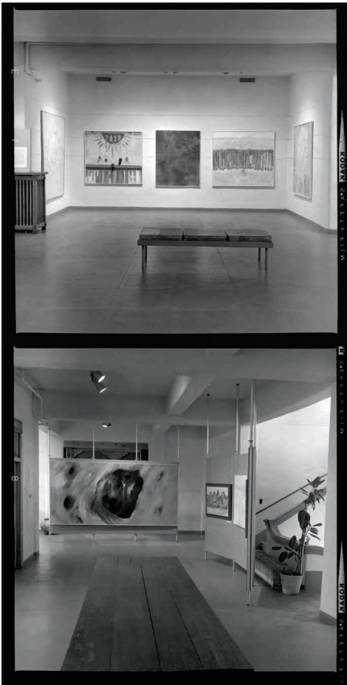
Top and Bottom: Young Indian Painters exhibit, Museum of Fine Arts (now New Mexico Museum of Art), Santa Fe, New Mexico, 1966. Photographer unknown. Courtesy Palace of the Governors Photo Archives (NMHM/DCA), Negative Numbers 050037, 050038.

mummy from Jemez forms the center of the exhibit. It is flanked by beautiful hand made fabrics from the Indian villages of Guatemala.” 10