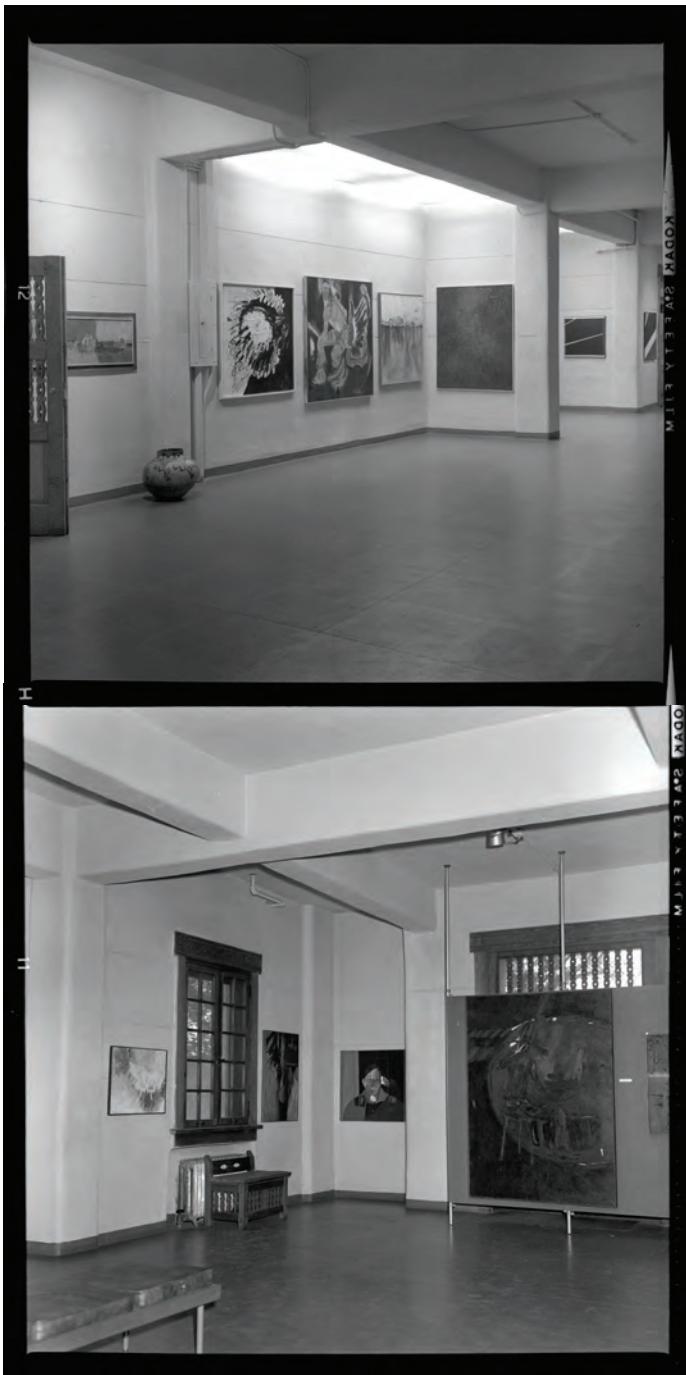
Top and Bottom: Work by faculty and students of the Institute of American Indian Arts was exhibited in the Museum of Fine Arts (now New Mexico Museum of Art) in 1966. A New Mexican review stated, " Young Indian Painters demonstrates a new step in indigenous art. Though much traditional influence is shown, so are contemporary art modes...[T]here is no uniform approach to creativity here. The sensitive and perceptive instructors at the Institute have helped each individual develop his own style." Neg. Nos. 050044, 050042.

ing from his culture, or an Indian painter may be caustically labeled a 'professional Indian' by fellow artists who feel that he is unfairly trading on his Indian status. But art is free and in the United States in the 1960s it is possible and valid to work from any source which helps the creator to 'do his own thing.' 13 By 1990 art was less "free" in the United States, with federal legislation under the Indian Arts and Crafts Act enforcing standards of tribal membership in order to sell or have works be distributed as Indian art.