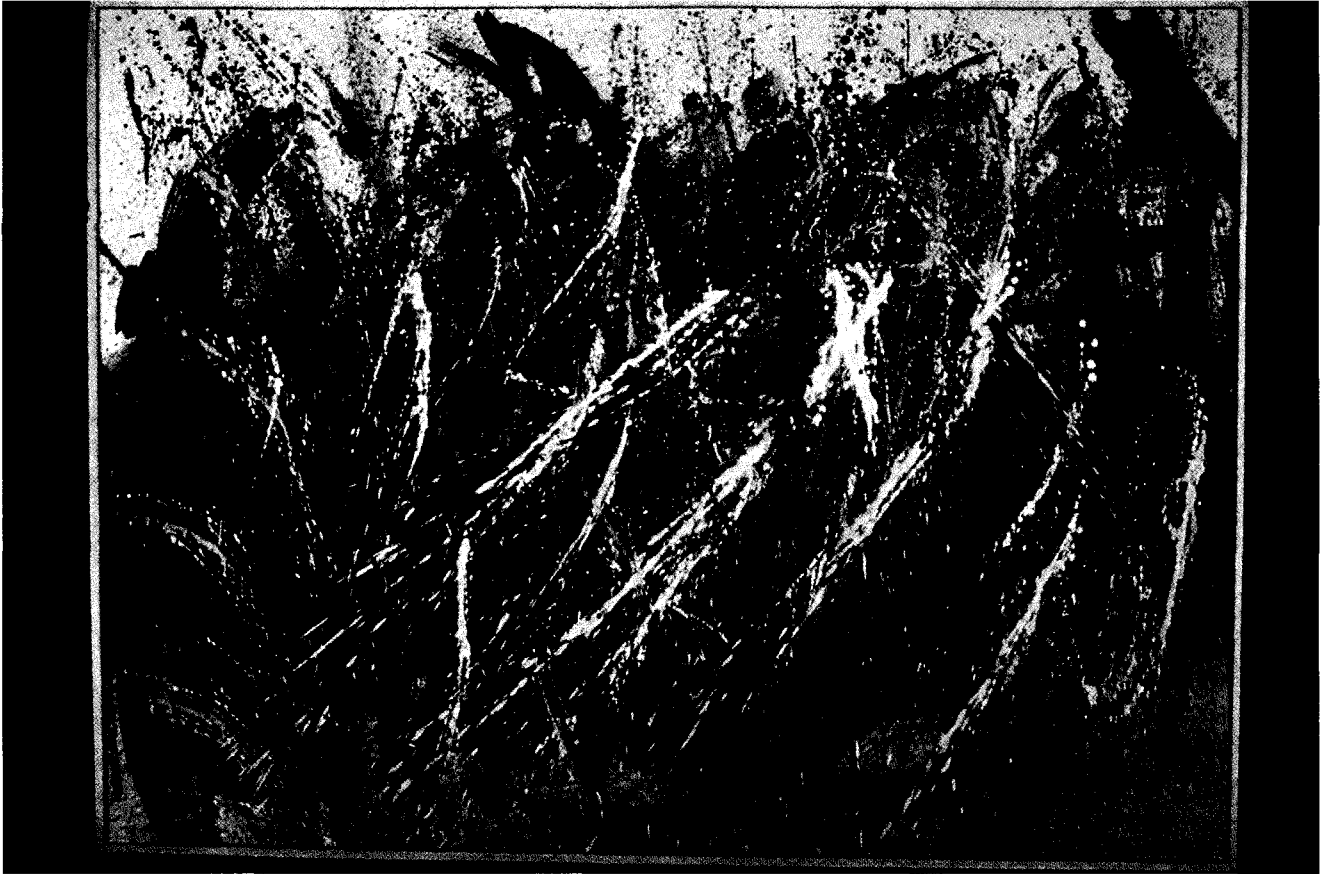
3. Untitled, by Alice Loiselle.

ernism simply an appropriation of tribal visual language motifs? If we accept the latter premise, as Lloyd New seems to advocate, that modernism is derivative, then the IAIA students in the 1960's were simply expanding their cultural repertoire in a new setting. If we accept the former premise, that modernism is a foreign influence adopted creatively and synthesized at great effort by talented young Indians, as Charlene Touchette's essays suggest then there was indeed a "revolution" - a totally new development.