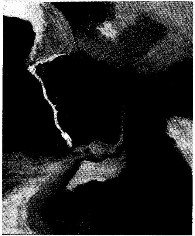
4. Nephlidia by Beverly DeCocteau Carusona.

While the images such as Beverly DeCocteau Carusona’s “Nephlidia” (Fig. 4) arrest the viewer with its commanding use of color and symbolism, the paintings themselves cannot be solely relied upon to interpret the complexities of native arts education. Alfred Youngman states in the exhibit conclusion that “many students’ lives were saved by their experience at the IAIA, which gave them the