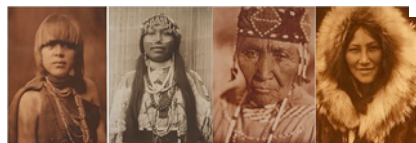
Fig 2. Edward Curtis photographs installed at the Autry Museum of the American West (February—May 2017).