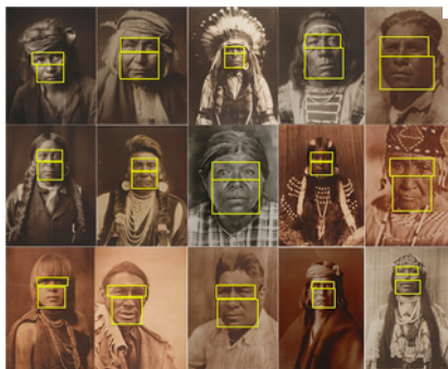
Fig 3. Predefined regions of interest (ROIs).

We examined participants' eye movements (lab setting only) to determine how attention was allocated and whether fixation locations differed depending on the condition (control, perspective-taking, suppression). We were particularly interested in comparing gaze allocations to the eyes with gaze allocations towards more decorative features of the photographs (e.g. clothing, jewelry, hair, ornaments, or background). For each of the fifteen presented photographs, decorative regions were defined as anywhere on the photograph that did not include the eyes, nose, or mouth (see Fig 3). Fixations were computed from raw eye movement data files consisting of time and position values using EyeMMV toolbox's two-step spatial dispersion threshold algorithm [16]. For each participant, we computed the average proportion of fixations that were located within the eye region and subtracted this from the average proportion of fixations that were located on decorative regions. We separately computed the minimum required effect sizes to detect differences in fixation allocation for each group (suppression, d = 0.460 ; control d = 0.480 ; perspective-taking, d = 0.480 ) as final sample size varied by condition (suppression N = 39 , two-tailed t-test, \alpha = 0.05 , 1-\beta = 0.80 ; control and perspective-taking N = 36 , two-tailed t-test, \alpha = 0.05 , 1-\beta = 0.80 ).