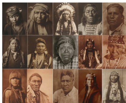
Fig 1. Final set of photographs chosen for inclusion in our lab portion of the study.